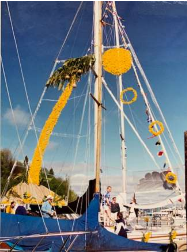
Daffodil Parade, 1995 CYCT—3 rd Place Kurt Leach designed the float.