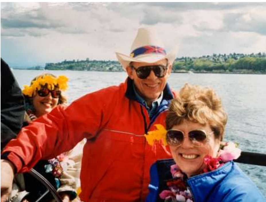
Daffodil Parade, 1995 Herb Weston