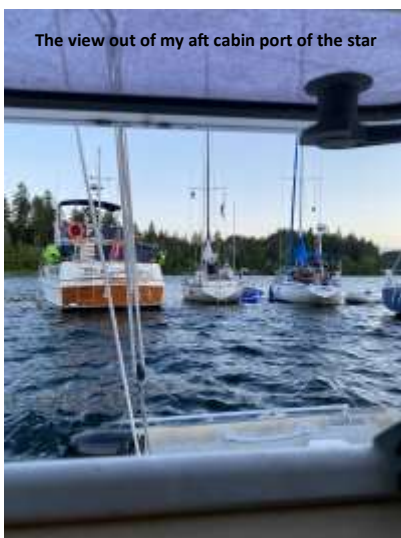
The view out of my aft cabin port of the star