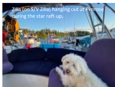
Zilla (on S/V Zilla) hanging out at Penrose during the star raft-up.