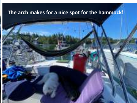
The arch makes for a nice spot for the hammock!