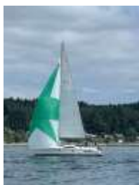
On The Cover Raven Double- Handed By Brock Van- Ravenswaay