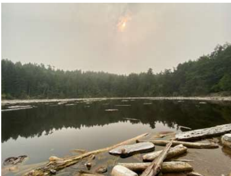
Red sun on San Juan Island