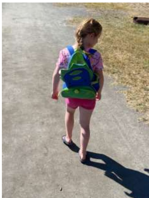
Shirt sleeve weather on Sucia