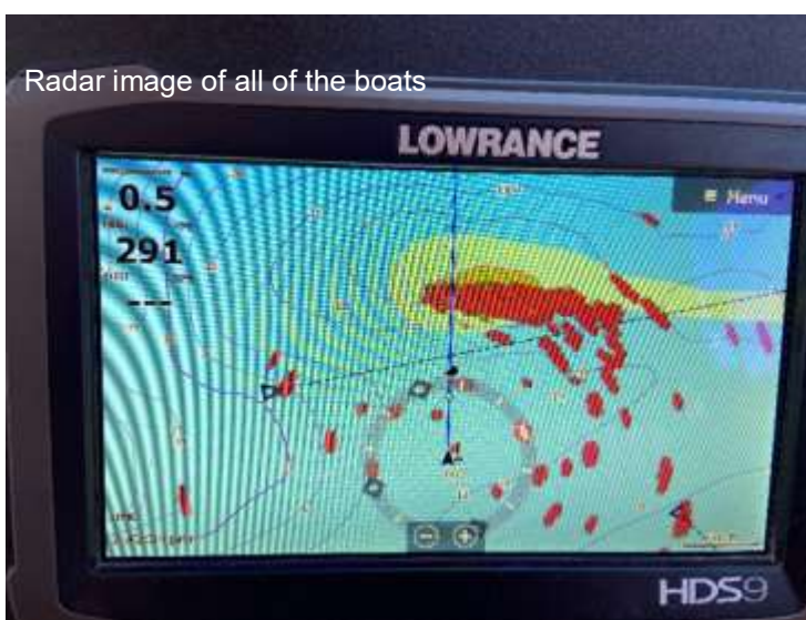
Radar image of all of the boats