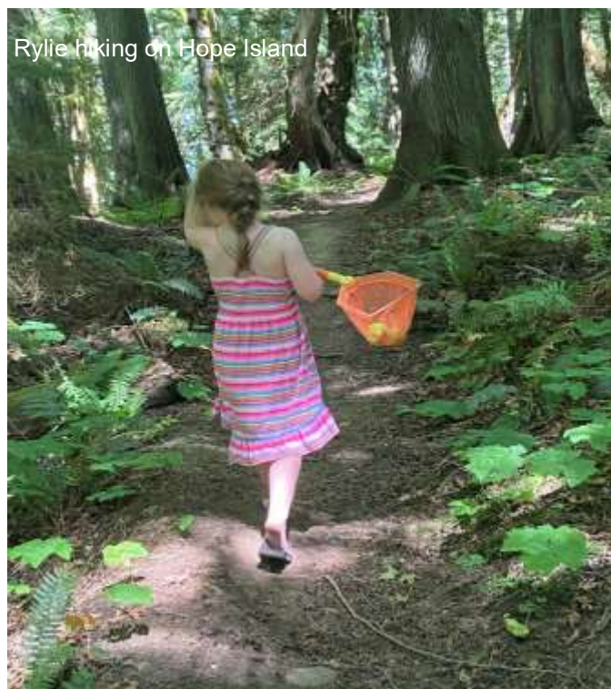
Rylie hiking on Hope Island