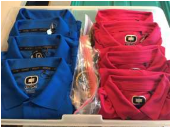
Ladies' Polo (Red)