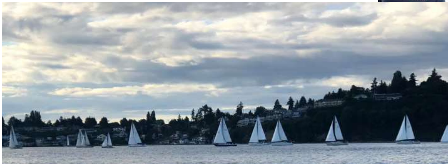
Windseekers Wednesday Night Race – June 24, 2020 - most of the fleet going into the first mark.