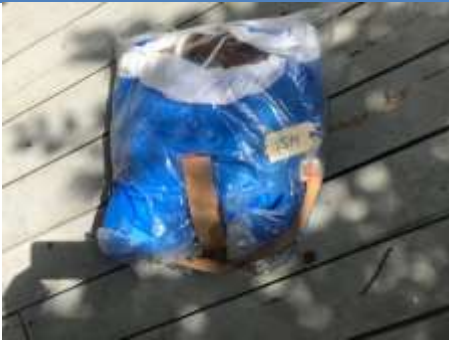
15 Meter Spinnaker Sock, LeeSails

Unused. $60. contact Don Kimball (206) 793-7414 (Call or Text)