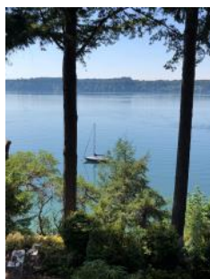
On The Cover "Sunset Run" By Cheryl White