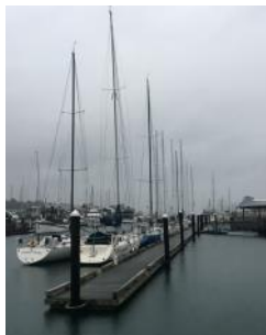
On The Cover Cruising in the Winter